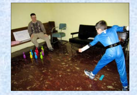
Thank you to the WVU Chapter of HILLEL for organizing and running the PURIM CARNIVAL . Fun was the flavor of the day!